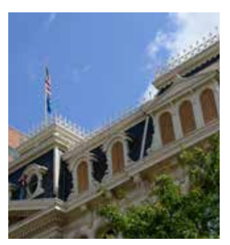
Window restoration - before

Thanks to generous grants from the Presser and Longwood Foundations, our operations department was able to repair and refurbish the windows that line the façade of The Grand and 824 alley, providing energy cost-savings and improved comfort to our visitors. Our technical crew worked simultaneously to restore the façade lighting and found replacement parts for an aging system in the process.