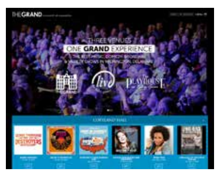
The new TheGrandWilmington.org

Reconfiguring the finance office enabled the department to revise financial statements, create new metrics, and improve reports for more detailed financial analysis and better forecasting, especially with regard to ticket sales.