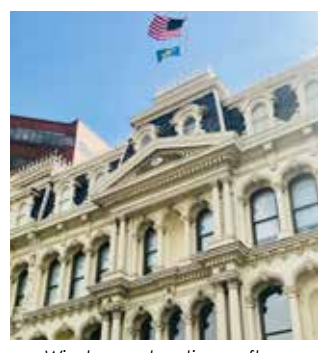
Window restoration - after

The Grand and Playhouse technical crews continued to deliver consistently good work behind the scenes. This season saw mostly flawless load-ins and load-outs, despite having The Playhouse loading area cut in half due to a crosswalk next to the Hotel DuPont. The hotel staff supported events by facilitating the comings and goings of our audiences through their lobby and helped to provide a good experience for all visitors.