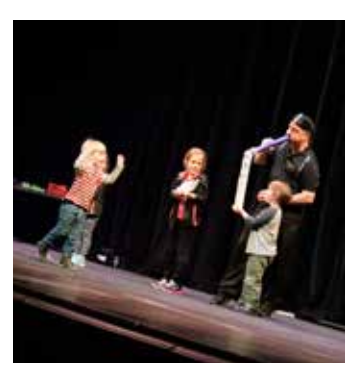
Sensory-friendly performance of Bubble Trouble

The Grand's Stages of Discovery program featured educational performances in all three venues and reached record numbers with more than 25,000 attendees. A memorable performance was presented in partnership with the Delaware Art Museum: Step Afrika's The Migration, Reflections on Jacob Lawrence . That collaboration, which also included Delaware Institute for the Arts in Education, filled two school matinees and a public show with enthusiastic audiences.